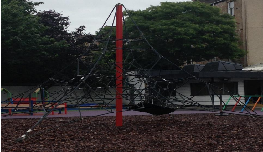
Activity Adventure Play Frame (monkey bars area of frame for over 8's and above)